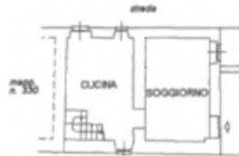
PIANO TERRA h = 2.45