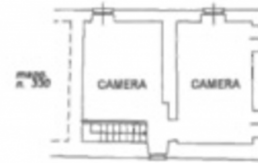
PIANO SECONDO h = 2.40