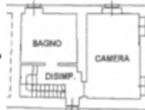
PIANO PRIMO h = 2.55