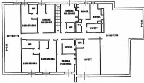
PIANTA PIANO SECONDO - H. 0.95 minima/H.2.30 massima